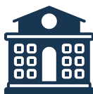
Schools & Universities

We always strive to meet the unique needs of groups and organizations. Our team has extensive experience conceptualizing, designing, and facilitating custom Active Bystander Intervention trainings for groups and organizations in the U.S and around the world, including but not limited to organizations and groups in the categories listed below.